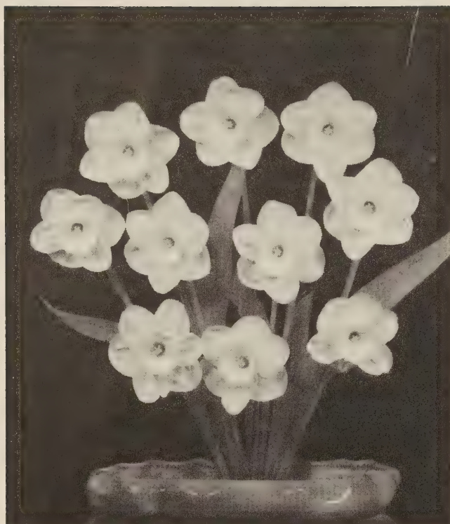
GREEN ISLAND (Page 9)

GUSTO (Wilson) 2a M. 16". A rich deep yellow of very good form. Not very tall, but a vigorous, stiff-stemmed good garden flower. $1.00 each.